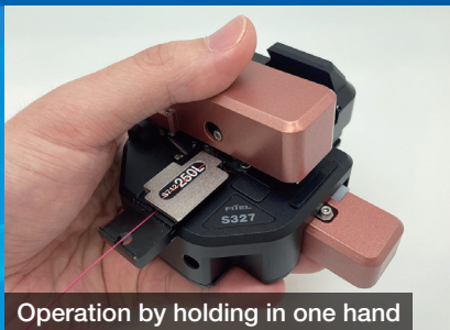
Operation by holding in one hand