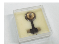
Blade Exchange Set (Optional component)

FURUKAWA ELECTRIC CO., LTD. https://www.furukawa.co.jp/en/