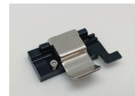
Single Fiber Adapter