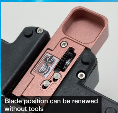
Blade position can be renewed without tools