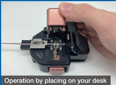
Operation by placing on your desk