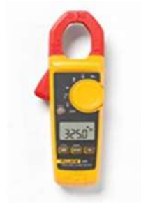
Fluke 323 True-RMS Clamp Meter