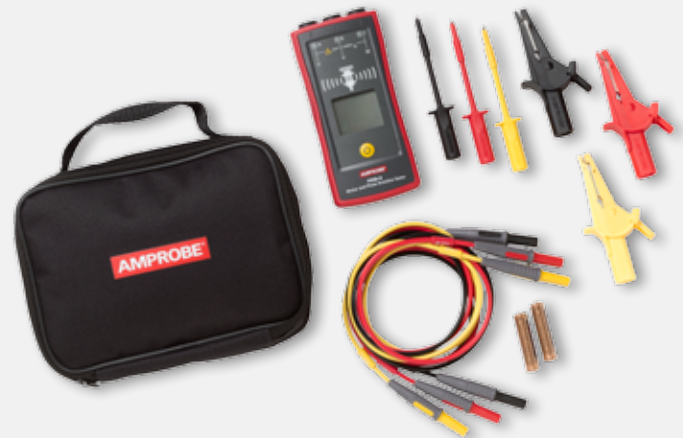
Accessories Included: 3 test leads, 3 test probes, 3 alligator clips, user manual, carrying bag, 2 AAA batteries.