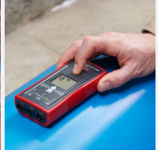
Non-contact, wireless motor rotation detection on running motors