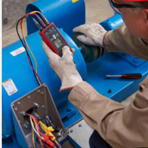
Indicates motor rotation of disconnected motors when spinning the shaft by hand